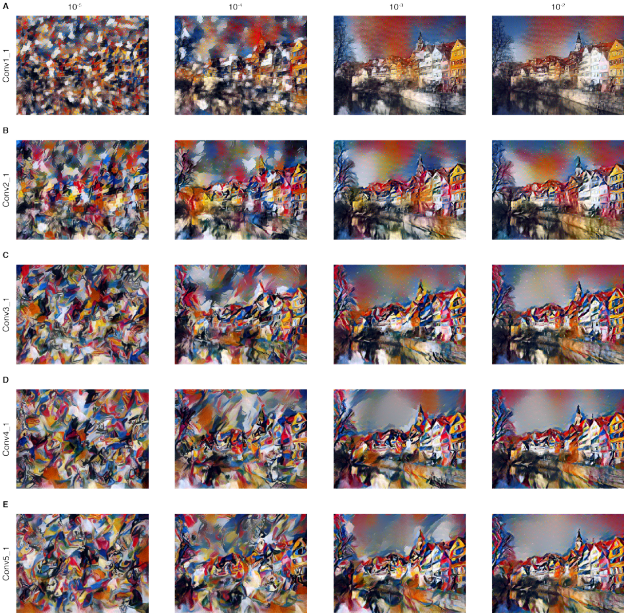
Figure 3: Detailed results for the style of the painting Composition VII by Wassily Kandinsky. The rows show the result of matching the style representation of increasing subsets of the CNN layers (see Methods). We find that the local image structures captured by the style representation increase in size and complexity when including style features from higher layers of the network. This can be explained by the increasing receptive field sizes and feature complexity along the network’s processing hierarchy. The columns show different relative weightings between the content and style reconstruction. The number above each column indicates the ratio \alpha/\beta between the emphasis on matching the content of the photograph and the style of the artwork (see Methods).